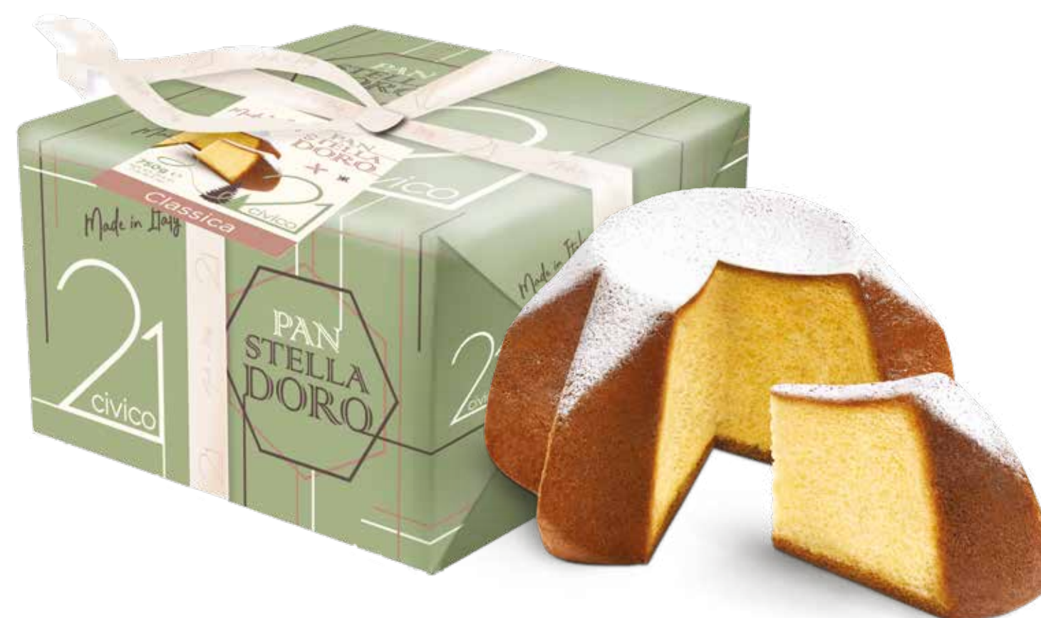
— CIV004 — StellaDoro Classica 6*750gm