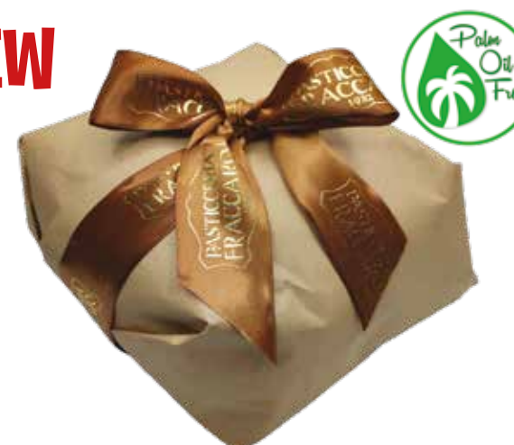
— FGIA — Panettone Gianduja 6*750gm

Hand-crafted with passion, using sourdough and only the finest ingredients!