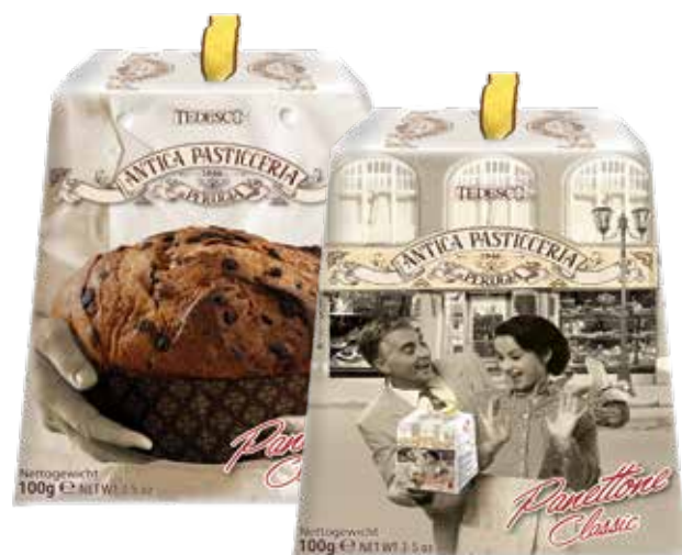
— AP287 — Mini Panettone Classico 36*100gm