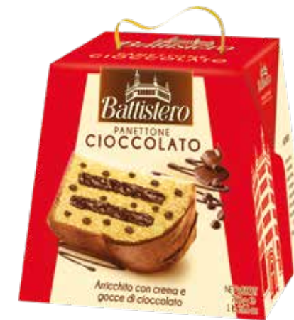
— PT3809 — Panettone Chocolate Cream & Drops 6*750gm