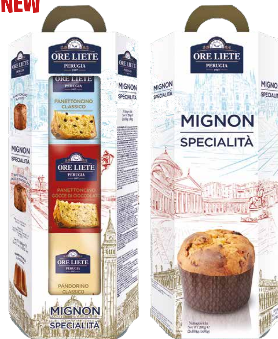
— OL060 — Mignon - Panettone Classico, Choc & Pandoro 8*280gm