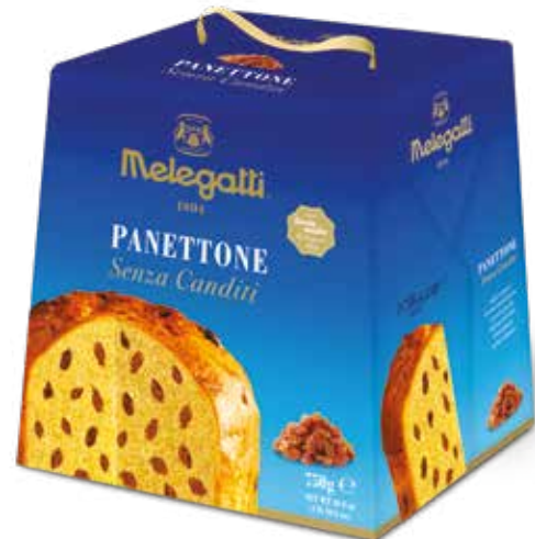
— PNT105 — Panettone no candied fruit 12*750gm