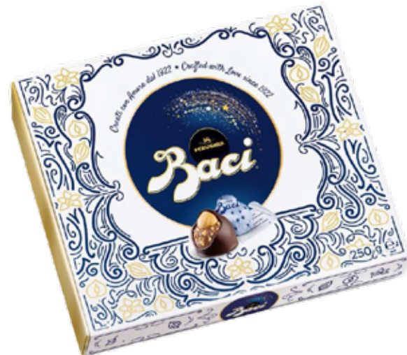
— B8344 — Baci Assorted Xmas Box 10*250gm

The perfect countdown to Christmas day the Baci Perugina way!