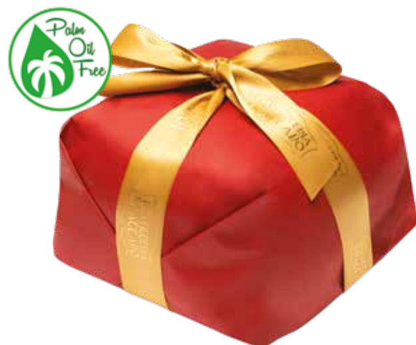
— FACI — Panettone Classico 6*750gm

Own Label option available on mixed orders for a minimum of 6 cases!