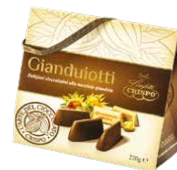
— SLEM — Gianduiotti bag 6*220gm

The smooth texture, rich flavor, and iconic triangular shape, make them a beloved treat for chocolate lovers worldwide.