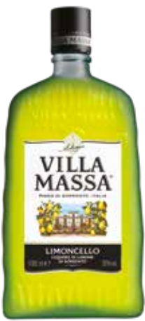
— LIM — Limoncello 6*50cl