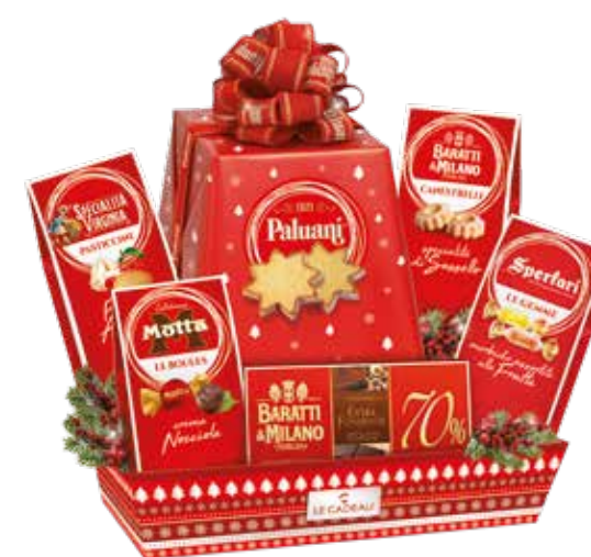
— H2018 — Agrifoglio 6pcs