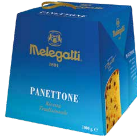
— PNT001 — Panettone Classico 12*1000gm