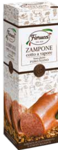
— FRZA — Zampone 1*1000gm

Cotechino and Zampone Fiorucci are iconic Italian delicacies, both made from a mixture of high-quality pork meat and spices, but with a unique twist. Cotechino is a large sausage traditionally served sliced and paired with lentils, while Zampone is a stuffed pig's trotter, boasting a rich and flavorful filling. Together, they represent a delicious and festive addition to any traditional Italian feast.