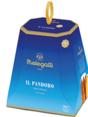
— PRT082 — Pandoro Classico 12*750gm