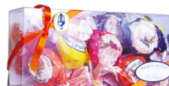
— SAF — Soft Amaretto Fruit transparent box 7*250gm Page 28 - Skoulikas Bedford Christmas 2023