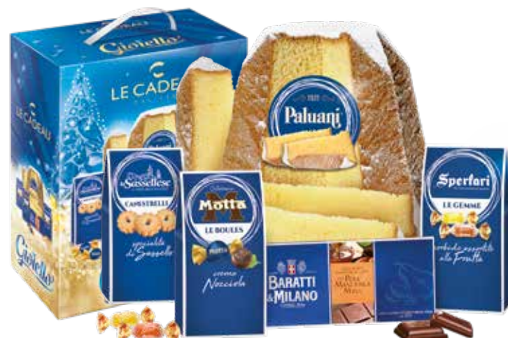
— H2015 — Gioiello 5pcs