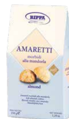
— A002 — Soft Almond Amaretto 10*150gm