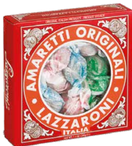
— LZAM — Amaretti window box 12*200gm

Handcrafted with meticulous care by the Lazzaroni family since 1718, these artisanal amaretti biscuits embody centuries of tradition, offering a moment of pure indulgence that transports you to the enchanting streets of Italy with every bite.