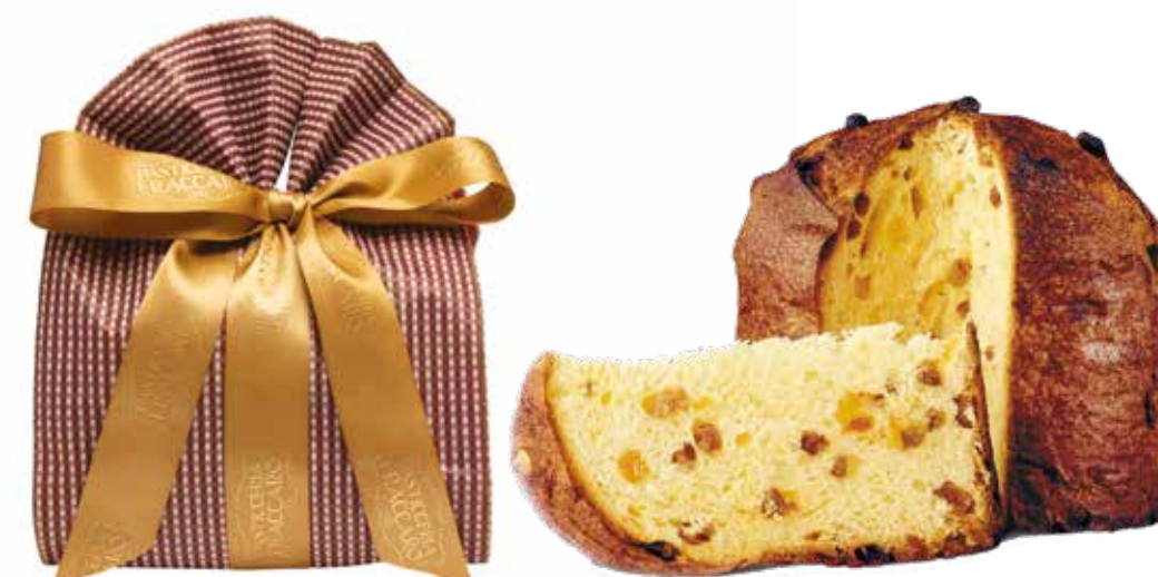
— ELCL — Panettone Classico 6*750gm

A selection of fine cream Panettone hand-wrapped in elegant cloth and finished with a fine satin ribbon.