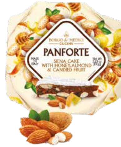
— BH2219 — Panforte Honey & Almond 10*100gm