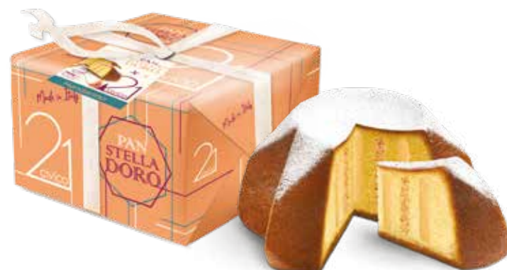
— CIV001 — StellaDoro Mandarin 6*750gm