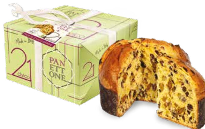
— CIV002 — Panettone Pear & Chocolate 6*750gm