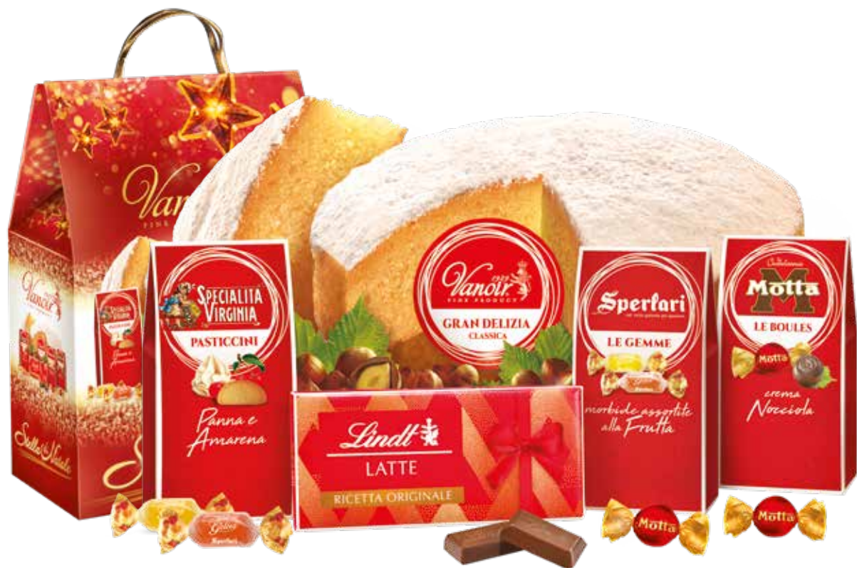
— H2010 — Stella di Natale 5pcs