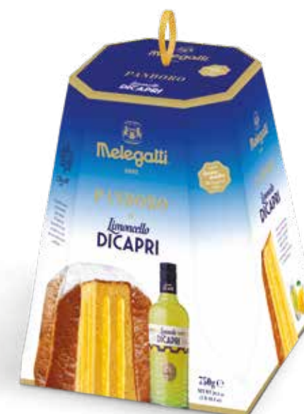
— PRF085 — Pandoro Limoncello di Capri 12*750gm

Melegatti's Ambrosoli Pandoro with its golden dough softened with milk cream and enriched with the aromatic taste of Italy's most renowned Honey.....a combination of two icons!