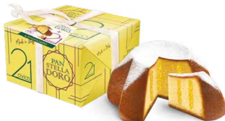
— CIV005 — StellaDoro Limoncello 6*750gm

21 Corso Porta Borsari, in the heart of the city of Verona is where the history of the pandoro began. In memory of this magical place, Civico 21 Stella Doro is born, characterised by raw materials of extreme quality and recipes inherited from the long tradition started in 1894