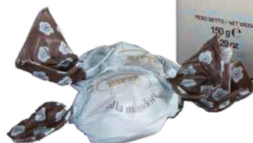
— A077 — Soft Amaretto biscuit tin 8*150gm