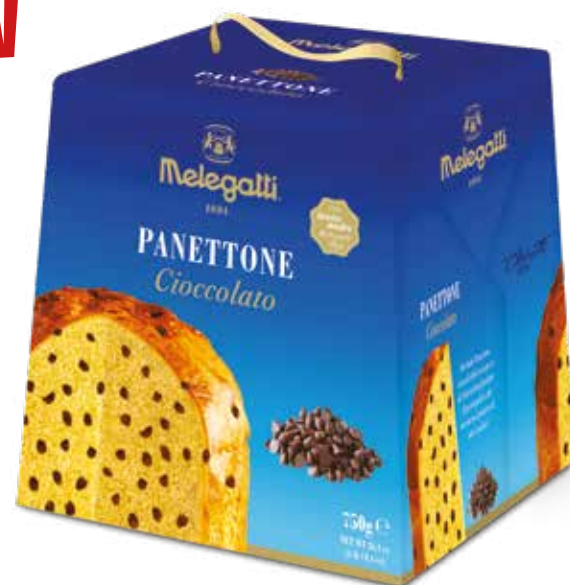
— PNF030 — Panettone Chocolate Chip 12*750gm

A combination of sustainable Cacao Trace® certified dark chocolate and caramelized white chocolate with salted butter caramel cream perfectly balanced.... sweetness seldom comes this good!