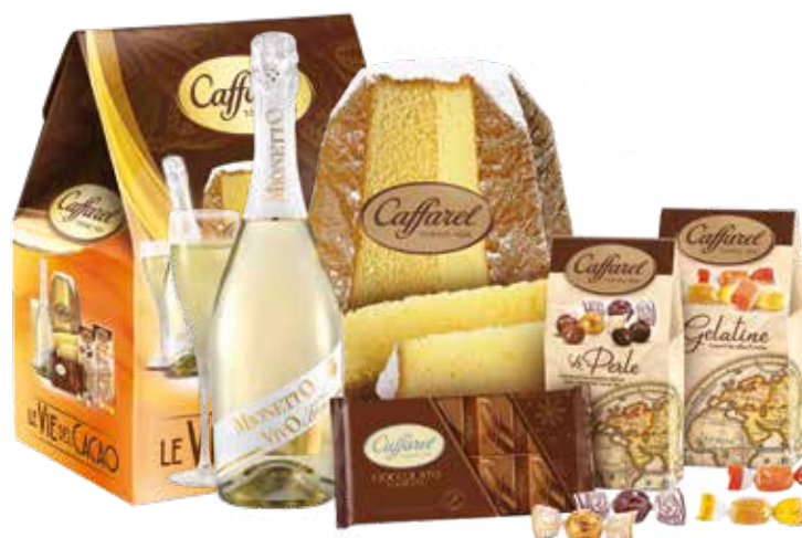
— H2025 — Le vie del cacao Caffarel 5pcs