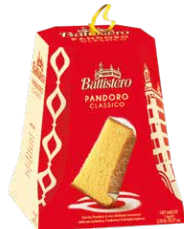
— PD1079 — Pandoro Classico 9*1000gm