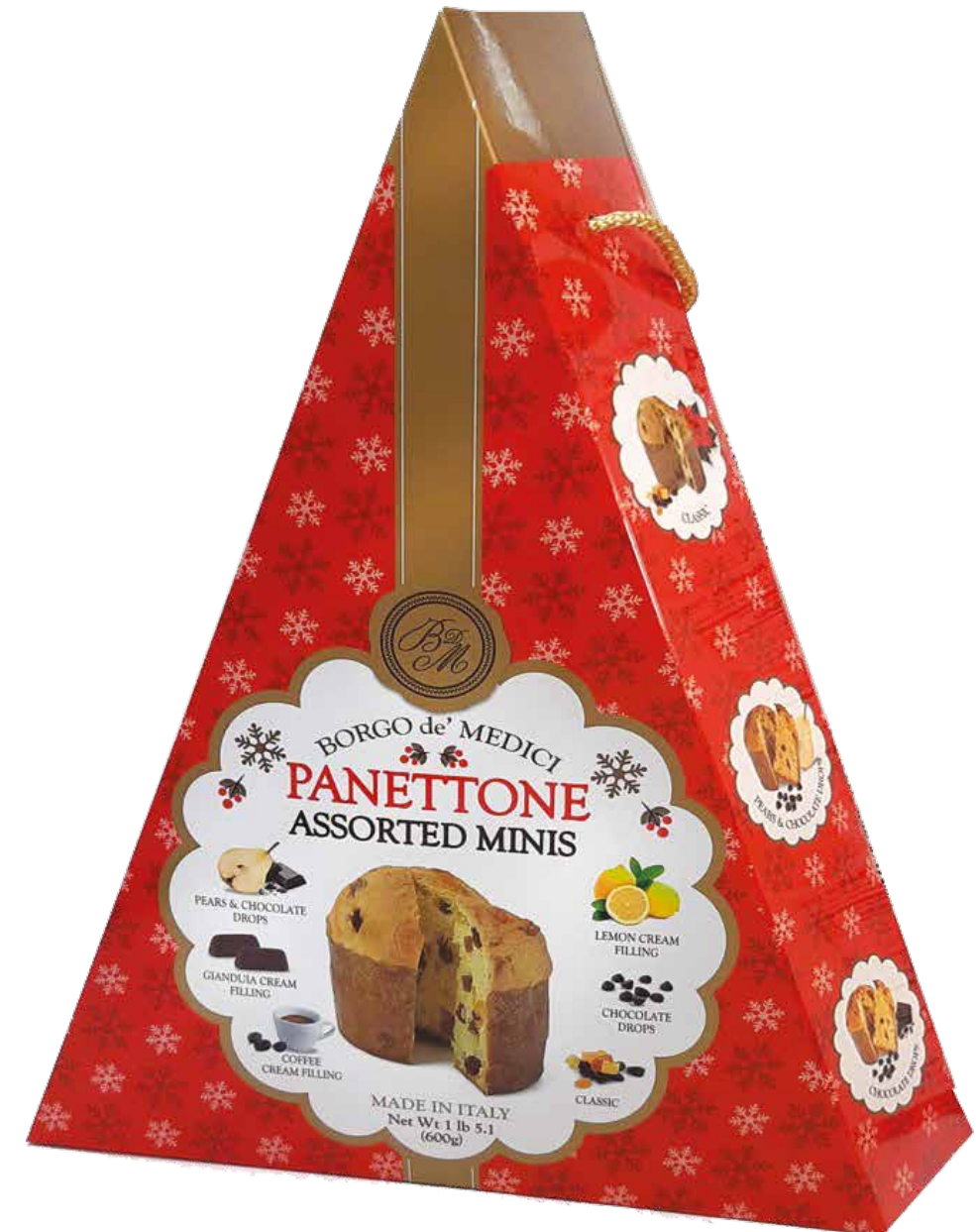
— AS02259 — Assorted Panettone Pyramid 4*6*100gm

Mini Panettone assorted box, a delightful collection of six distinct flavors that will transport your taste buds to a world of Italian Christmas magic with every bite.