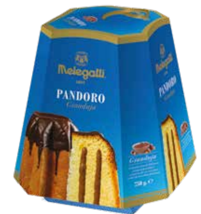
— PRF083 — Pandoro Gianduja 12*750gm

Melegatti, the proud inventors of Pandoro, have crafted a legacy of culinary excellence, perfecting the art of creating this golden Italian Christmas delicacy for over a century. When you say Pandoro you say Melegatti!