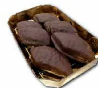
— MOST — Chocolate Mostaccioli Gold Line 6*200gm

A festive combination of spices and dark chocolate Neapolitan style.