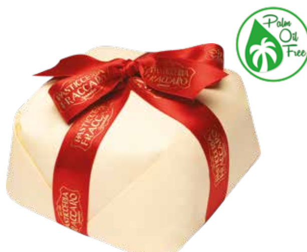
— FLIM — Panettone Limoncello 6*750gm