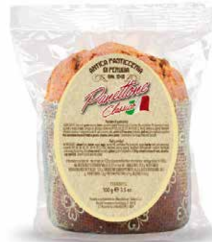
— AP337 — Mini Panettone Cellophane 48*100gm

Mini panettoni are delightful bite-sized versions of the traditional Italian sweet bread, perfect for indulging in the festive flavors of citrus, dried fruit, and a hint of warm spices.