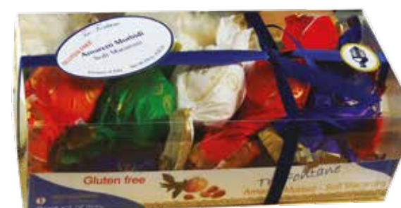
— SATR — Soft Amaretto transparent box 7*250gm