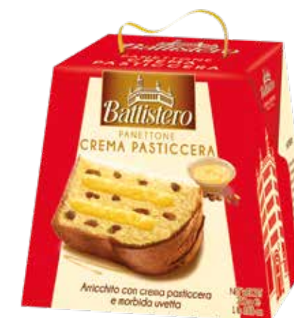
— PT5034 — Panettone Pasticceria Cream & Uvetta 6*750gm