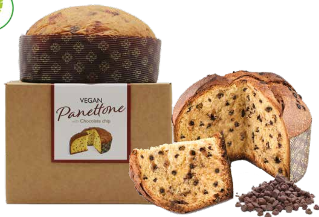
— PVVC — Vegan Panettone Choc Chip 6*500gm