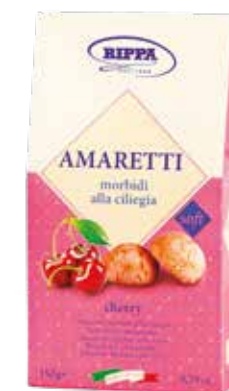
— A008 — Soft Cherry Amaretto 10*150gm

Individually wrapped soft Italian Amaretto biscuits in various flavours with their delicate and soft texture, are a delectable treat that epitomises the skill and craftsmanship of fine Italian pastries.