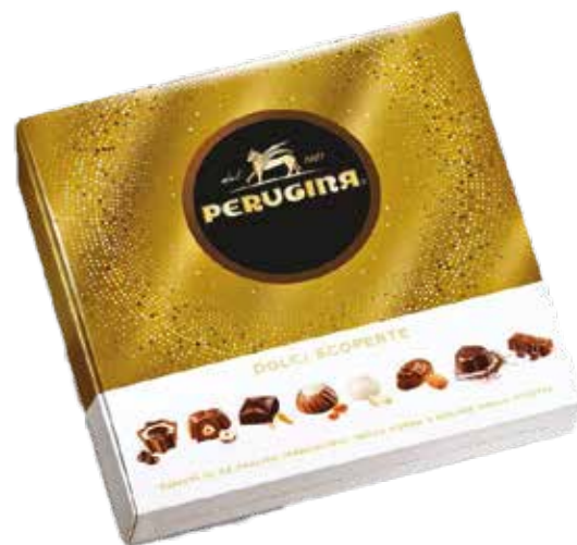
— B5231 — Perugina Dolci Scoperte 8*200gm

Contains 20 Baci Perugina Original Dark.