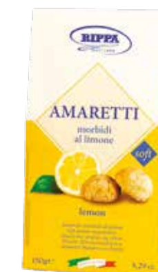
— A003 — Soft Lemon Amaretto 10*150gm