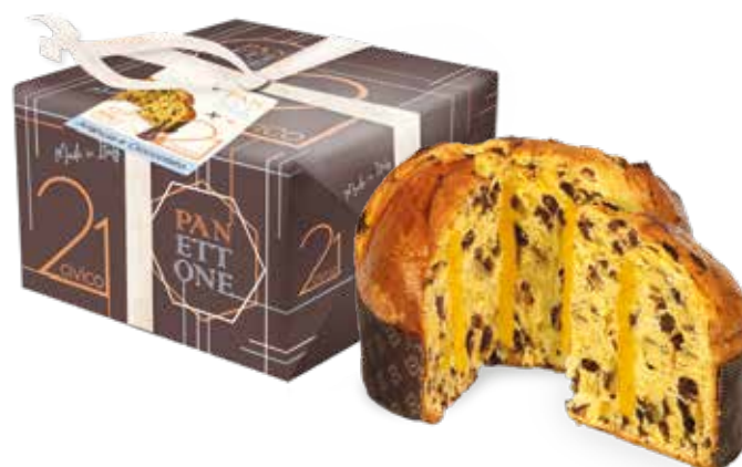
— CIV003 — Panettone Chocolate & Orange 6*750gm