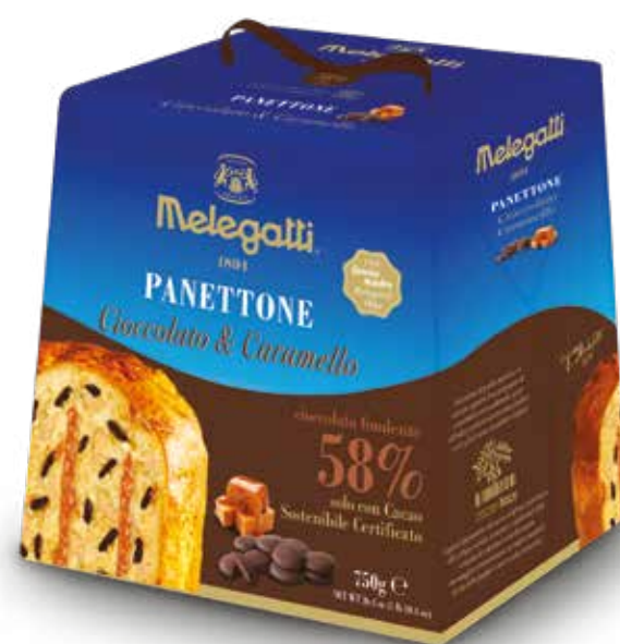
— PNF059 — Panettone Caramel & Chocolate 12*750gm