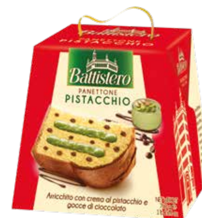
— PT5031 — Panettone Pistachio Cream & Choc Drops 6*750gm