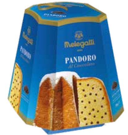
— PRF077 — Pandoro Chocolate Chip 12*750gm