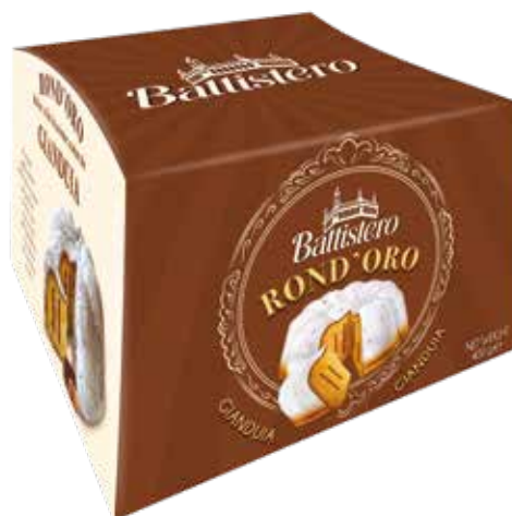
— RONGI — Rond'Oro Gianduja 12*400gm