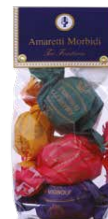
— SAW — Soft Amaretto sweet wrap 12*150gm