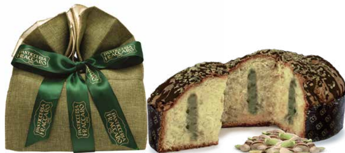
— ELPI — Panettone Pistacchio 6*750gm