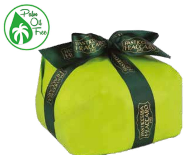
— FPPI — Panettone Pistacchio 6*750gm