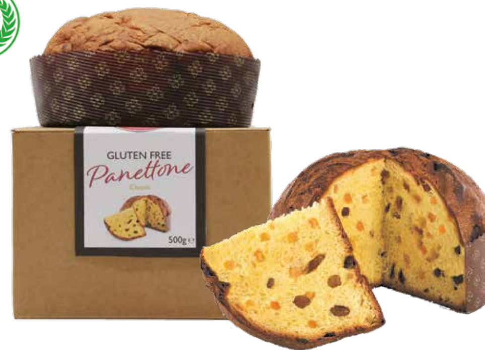
— PVGF — Gluten Free Panettone Classico 6*500gm