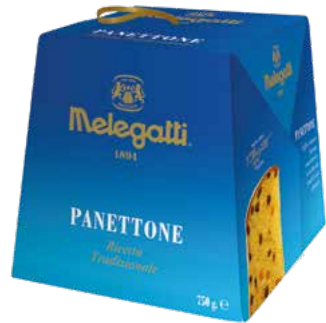
— PNT002 — Panettone Classico 12*750gm