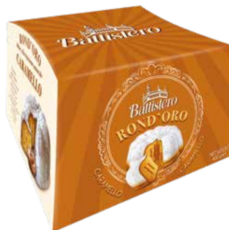
— RONCA — Rond'Oro Caramel 12*400gm