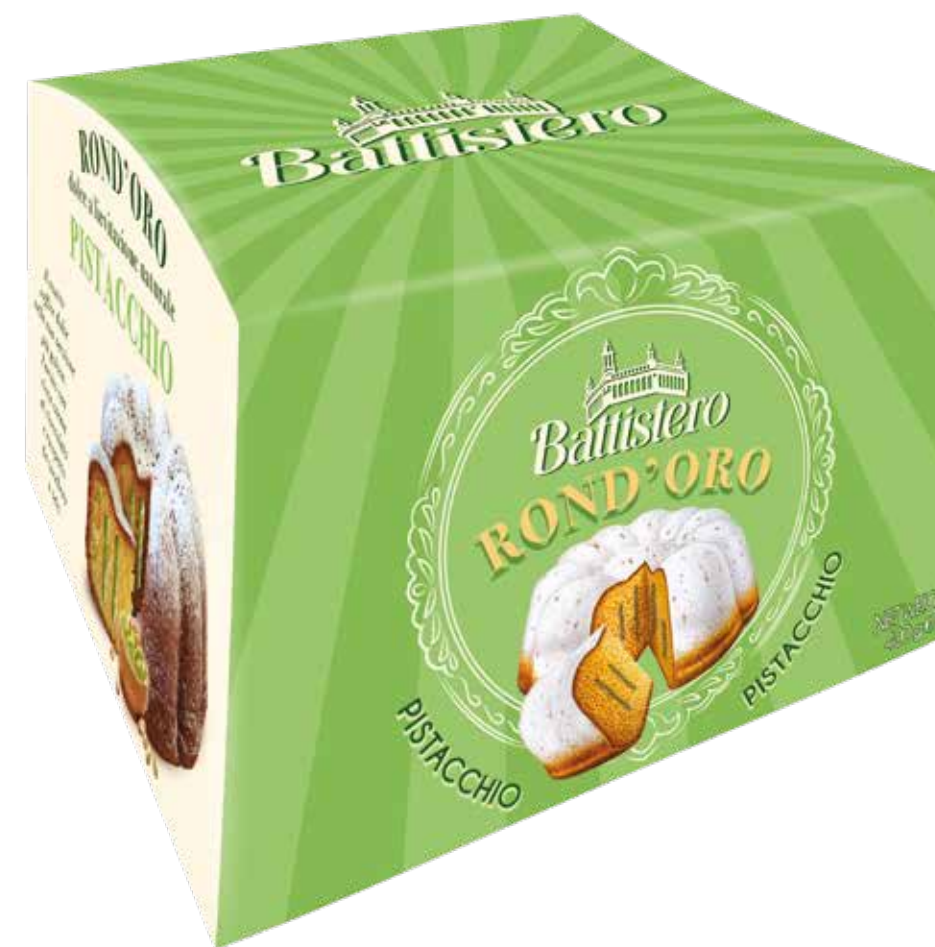
— RONPI — Rond'Oro Pistachio 12*400gm