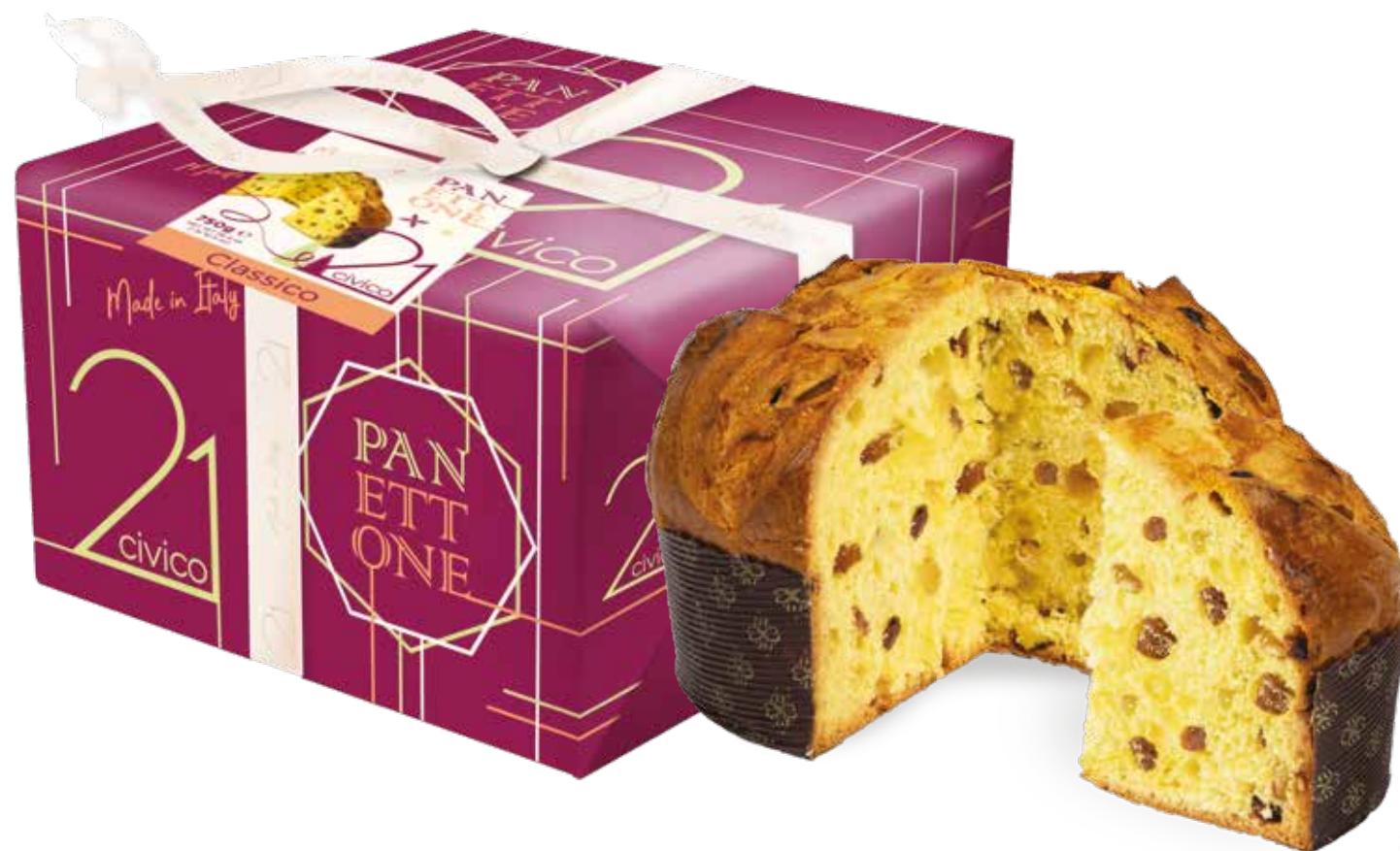
— CIV000 — Panettone Classico Basso 6*750gm