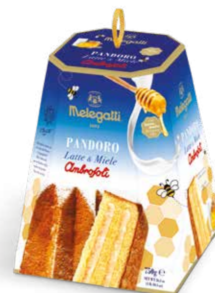
— PRF131 — Pandoro Honey Ambrosoli 12*750gm