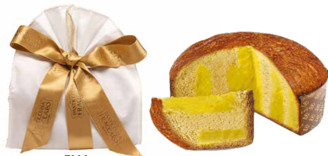
— ELLI — Panettone Limoncello 6*750gm