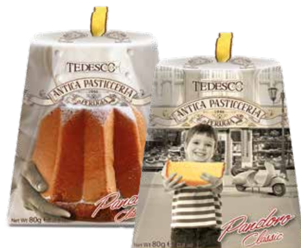
— AP279 — Mini Pandoro 36*80gm