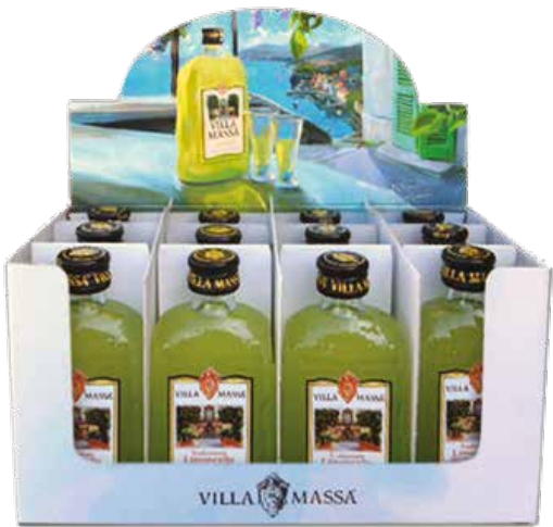
— LIMS — Limoncello Mignon 12*5cl