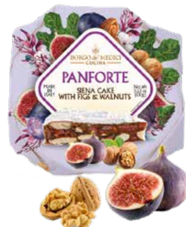
— BH2221 — Panforte Figs & Walnuts 10*100gm