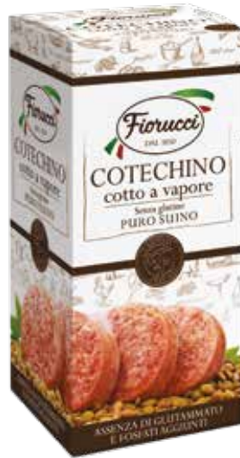
— FRCT — Cotechino 1*500gm