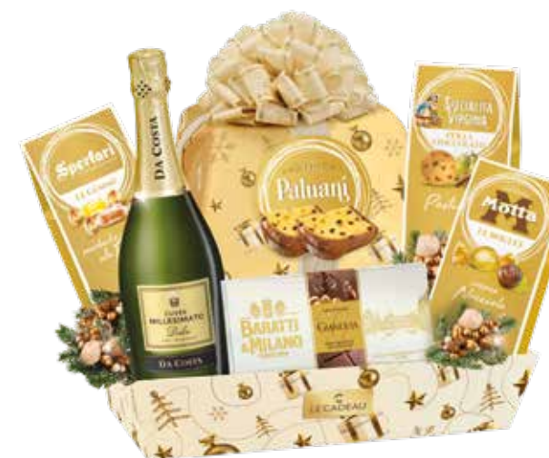
— H02017 — Merry Christmas 6pcs