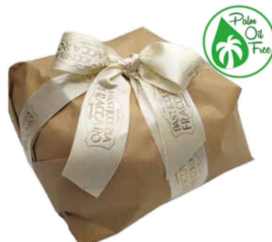
— FBRI — Panettone Bollicine Trevigiane 6*750gm