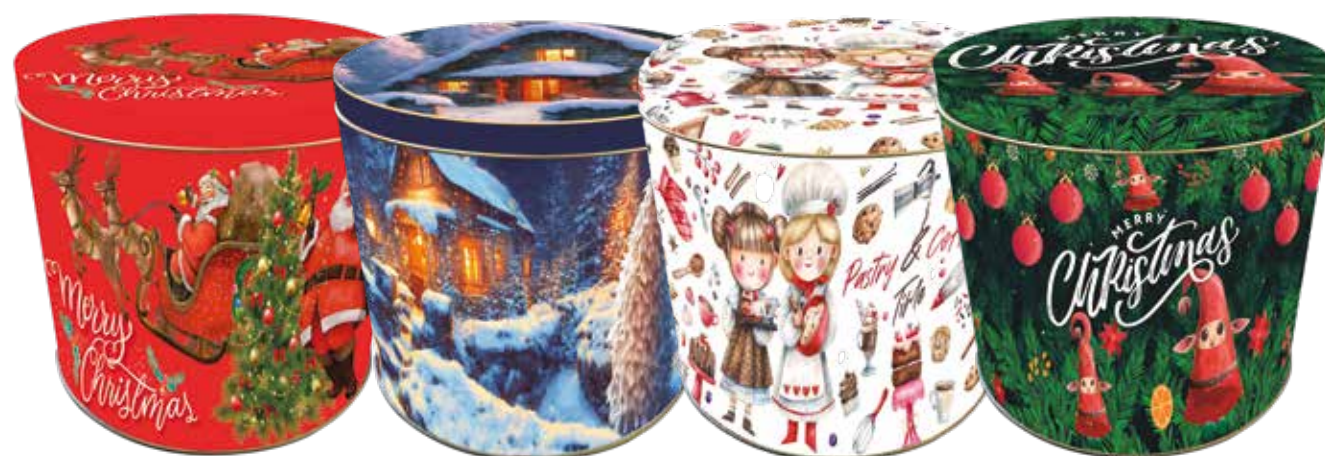
— PT3403 — Panettone Round Tin 8*1000gm

The smooth texture, rich flavor, and iconic triangular shape, make them a beloved treat for chocolate lovers worldwide.