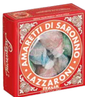
— LZAS — Amaretti small window box 18*65gm