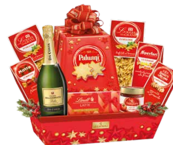
— H02030 — Gran Gala 8pcs