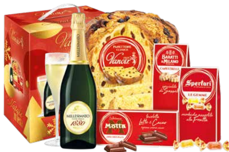
— H2005 — Natale in Festa Panettone 5pcs