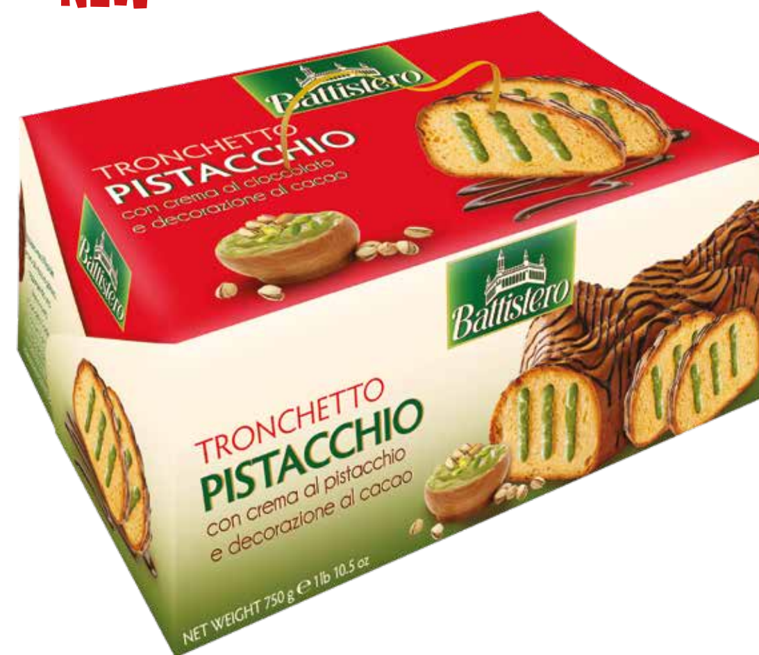
— TRONP — Tronchetto Pistachio 8*750gm