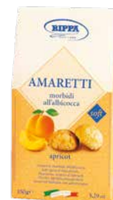
— A007 — Soft Apricot Amaretto 10*150gm