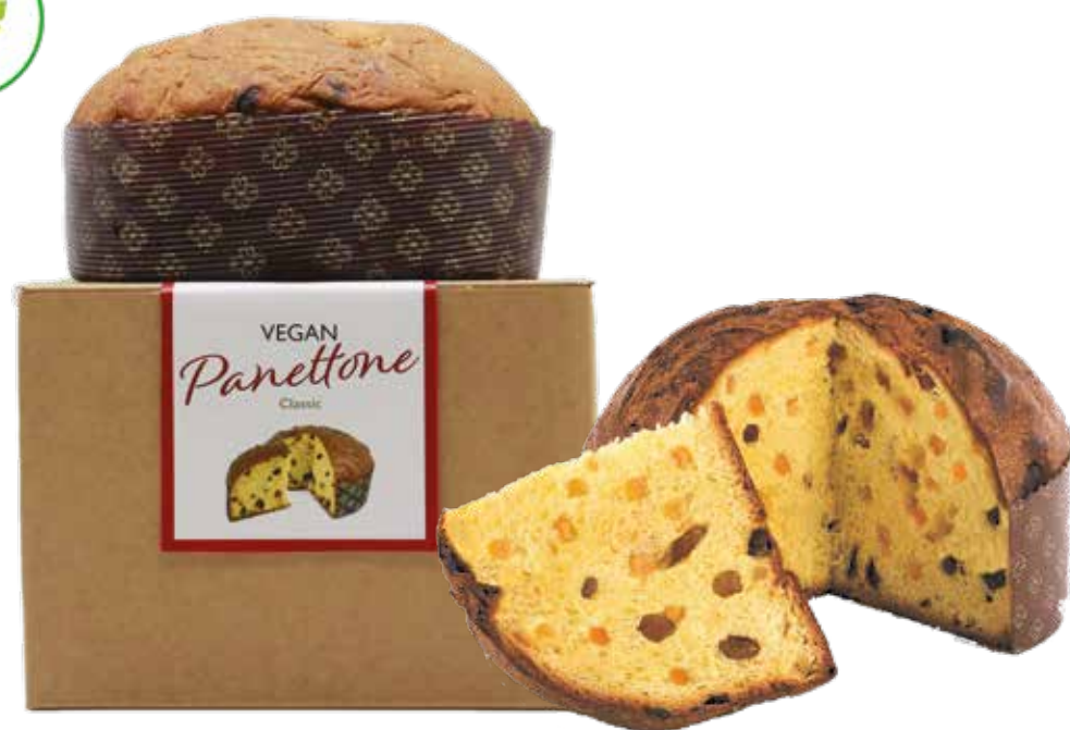
— PVVP — Vegan Panettone Classico 6*500gm