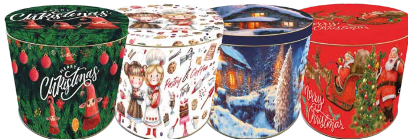
— PD1049 — Pandoro Round Tin 8*750gm

A festive combination of spices and dark chocolate Neapolitan style.