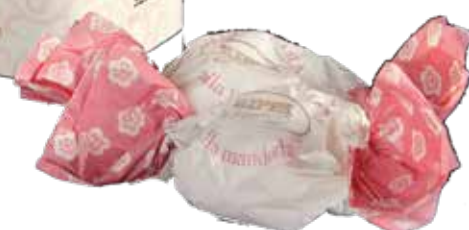
— B077 — Baci di dama biscuit tin 8*150gm

Using only artisanal production methods, finely selected ingredients and devotion to detail, Rippa soft Amaretto biscuits & Baci Di dama capture the essence of Christmas.... a time for fine dining and memorable gifting.