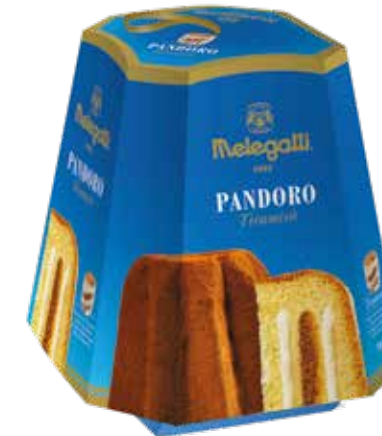
— PRF080 — Pandoro Tiramisù 12*750gm