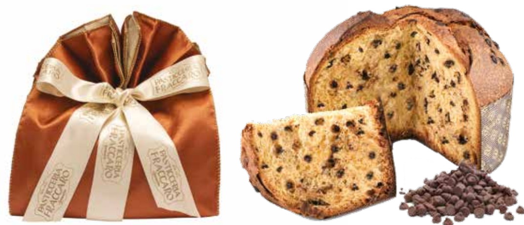
— ELPR — Panettone Chocolate Praline 6*750gm