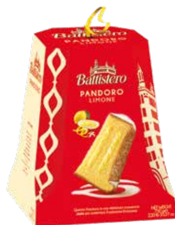
— PD1069 — Pandoro Lemon Cream 12*750gm

Panettone and Pandoro Battistero are delightful Italian celebration treats that bring joy and sweetness to festive gatherings with their rich flavors and exquisite textures.