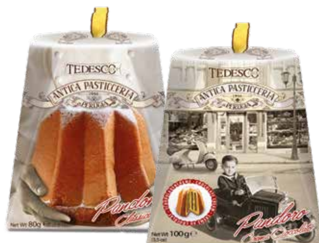
— AP129 — Mini Pandoro Chocolate 36*100gm