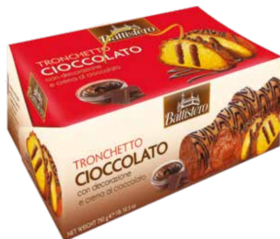
— TRONC — Tronchetto chocolate 8*750gm

Battistero Tronchetto is known for its delectable assortment of cakes, where every bite unveils a harmonious symphony of flavours that truly delights the taste buds.