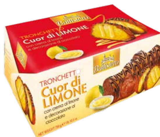
— TRONL — Tronchetto lemon 8*750gm