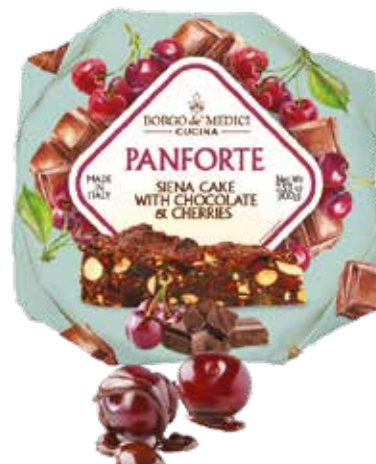
— BH2220 — Panforte Chocolate & Cherries 10*100gm