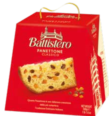
— PT4346 — Panettone Classico 6*1000gm