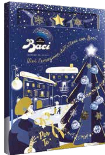
— B0877 — Baci Advent Calander 10*278gm

A little kindness everyday with Baci® Perugina®