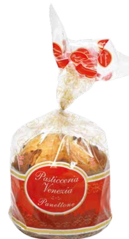
— FPVE — Palm oil free Panettone Classico 8*750gm