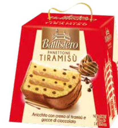
— PT4347 — Panettone Tiramisu' & Choc Drops 6*750gm

Cream-filled Panettone Battistero is a delectable twist on the classic Italian holiday treat, offering a delightful combination of fluffy, buttery panettone infused with luscious cream, creating a truly indulgent dessert experience.