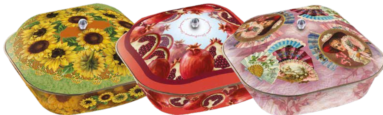
— PT3470 — Panettone Chocolate Tortiera Tin 10*600gm